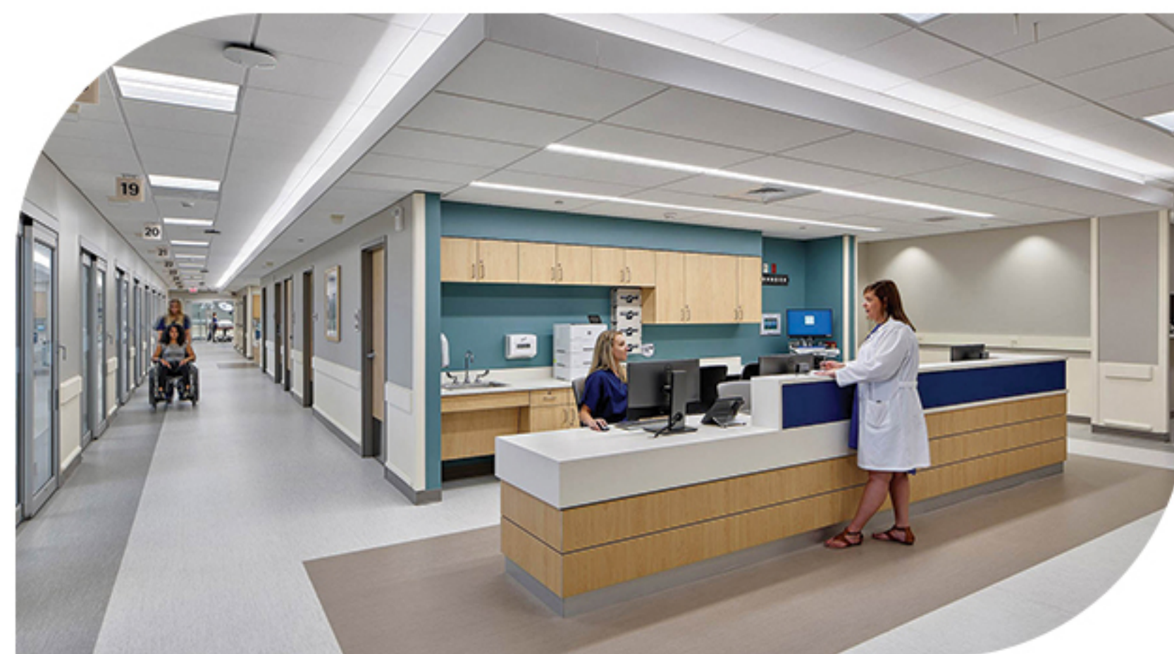
Hospitals - Clinics