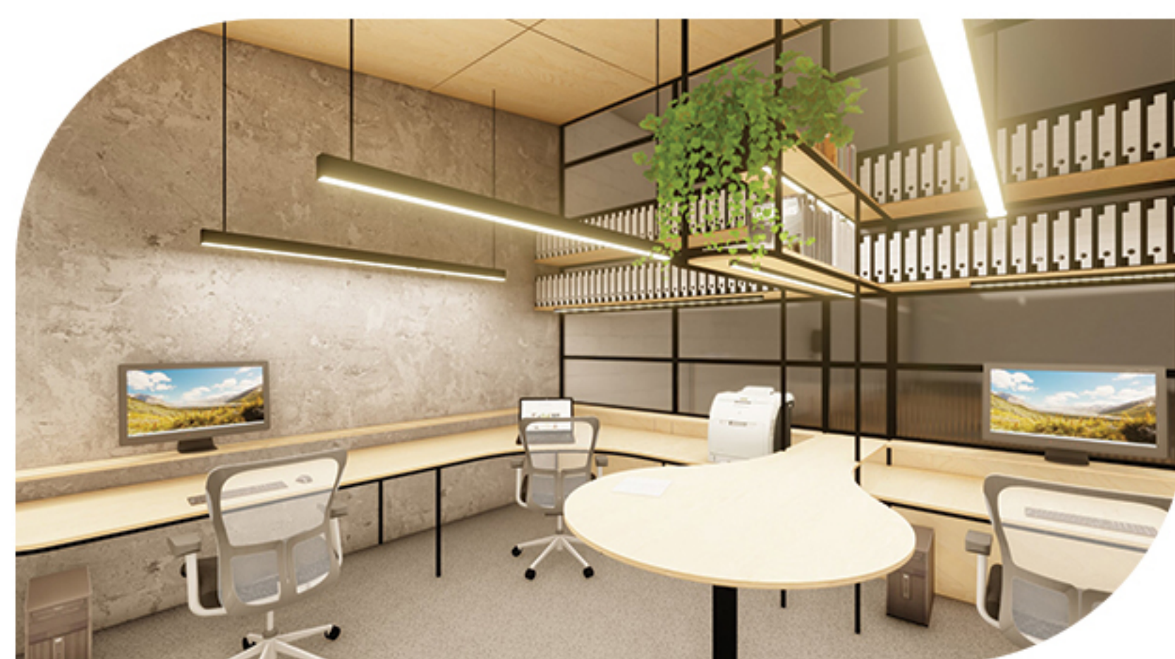
Offices - Showroom