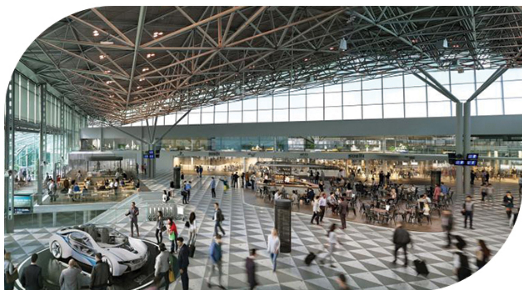
Airport - Stations