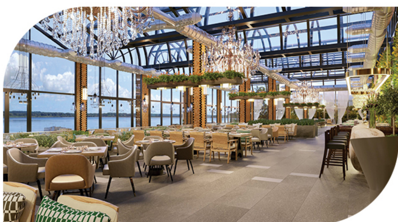
Hotel - Restaurants